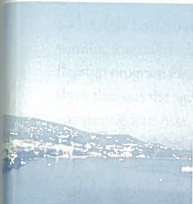
2 Mitena (Macocchio) Filazzola, TRSM '81, on holiday in Europe.